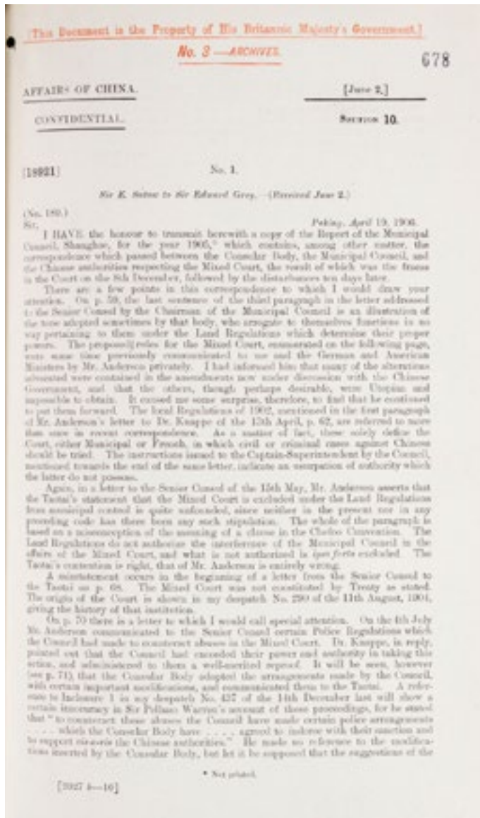
Despatch from Sir E. Satow: comments on some aspects of the correspondence between the Municipal Council and the Consular Body (Case 305, Paper 18921), April 19, 1906 [FO 371/178/54].

At other times, the SMC, pushing for more advantage vis-à-vis the Chinese authorities, was more in line with British diplomats’ conception of the needs of British interests in China. Following the republican revolution of 1911 that overthrew the Qing dynasty, the SMC, the British Consul-General at Shanghai, and the British diplomats in Beijing agreed that the International Settlement should be extended again (after the previous extension in 1899). In 1913, when