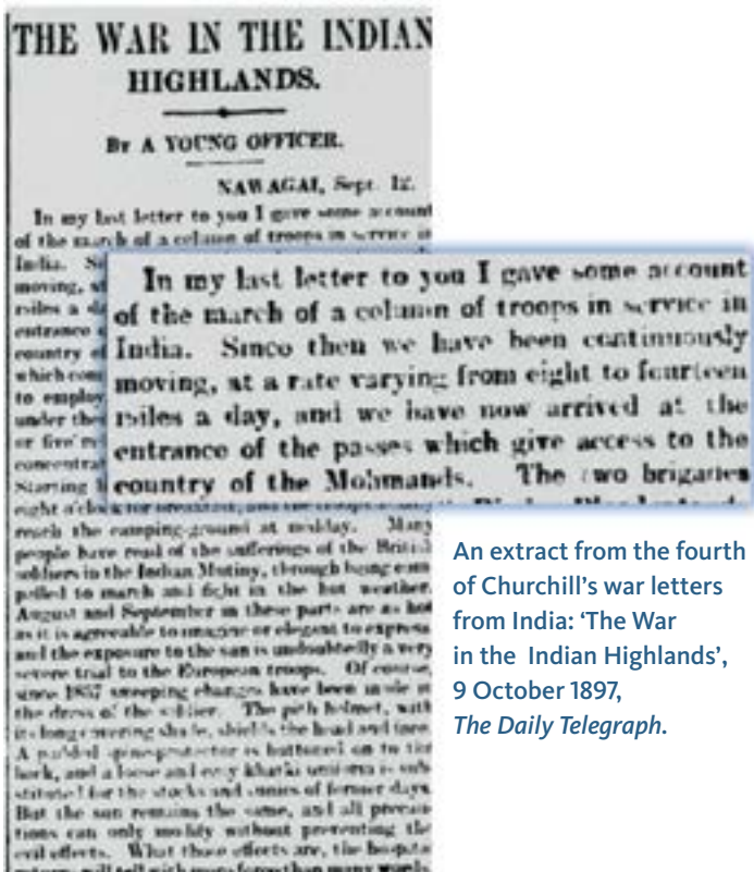
An extract from the fourth of Churchill's war letters from India: 'The War in the Indian Highlands', 9 October 1897, The Daily Telegraph .

Despite proclaiming that The Daily Telegraph was 'mean' and complaining about the editing, Churchill wrote 15 dispatches for the paper while he was attached to the Malakand campaign. 7 These dispatches were widely acclaimed and earned Churchill a solid reputation in London. They also formed the basis of his first book, The Story of the Malakand Field Force: An Episode of Frontier War (1898).