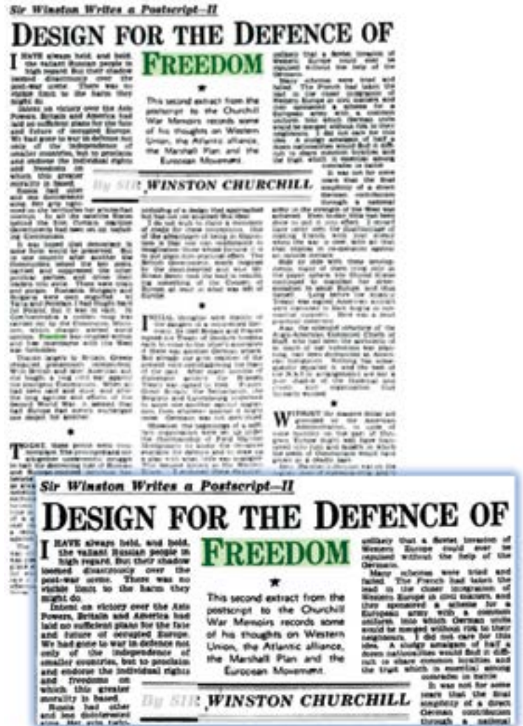
The second in a four-article postscript to Churchill's War Memoirs; 'Design for the Defence of Freedom', 22 April 1958, The Daily Telegraph .

Though Churchill left public life after the close of his premiership in 1955, the public were still very interested in him. Several articles were written about him during the twilight of his life, from his frequent painting trips to the welfare of his pets.