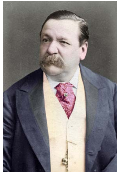
Portrait of George Augustus Sala, date unknown

murders, bigamous marriages and disguised identities, a direct acknowledgement of his own involvement with newspaper reporting. As a reporter for The Daily Telegraph , Sala would have had access to dramatic news stories all ripe for inclusion in his next piece of fiction and Sala's novels demonstrate this immersion in the newspaper world with plot lines that turn on the report of a death or a marriage, and by the insertion of graphic depictions of his fellow journalist colleagues. None of his novels sold particularly well, however, and they were all a victim of Sala's endless digressions which worked favourably in his leaders for The Daily Telegraph , and in articles for periodicals, but were cumbersome and distracting when it came to extended works of fiction.