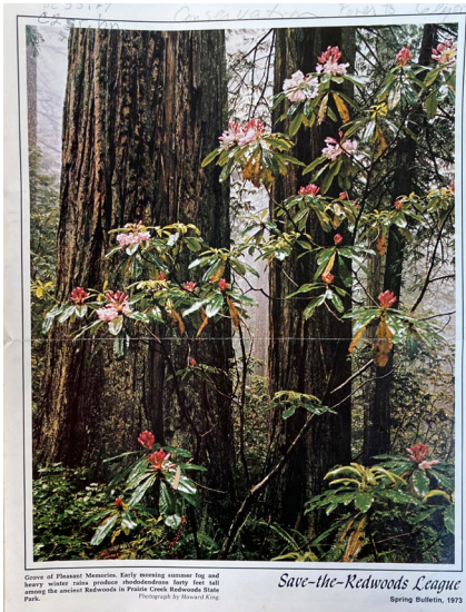
Save-the-Redwoods League Spring Bulletin, 1973, Institute of Governmental Studies Library, University of California, Berkeley.