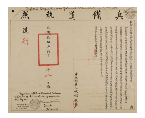
Deed between Taotai of Taiwan and R. J. Hastings of HM Consulate, Taiwan on renewing the lease of land registered as Lot No.50 at Anping. Sept 9, 1889 (FO 678/3016).