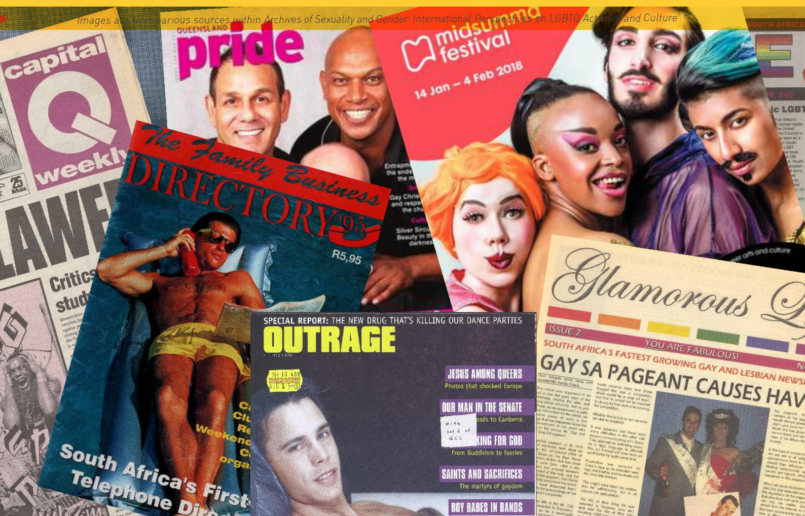
Images are from various sources within Archives of Sexuality and Gender: International Perspectives on LGBTQ Activism and Culture

The fourth module in the award-winning series Archives of Sexuality and Gender focuses on regions previously underrepresented in the study of LGBTQ people and issues, particularly southern Africa and Australia. International Perspectives on LGBTQ Activism and Culture highlights cultural and social histories, struggles for rights and freedoms, explorations of sexuality, and organisations and prominent figures in LGBTQ history in these regions, ensuring access to stories that could otherwise go untold. The archive also includes the papers of lesbian and feminist organisations, and lesbian culture internationally, as well as documentation of grassroots activism.