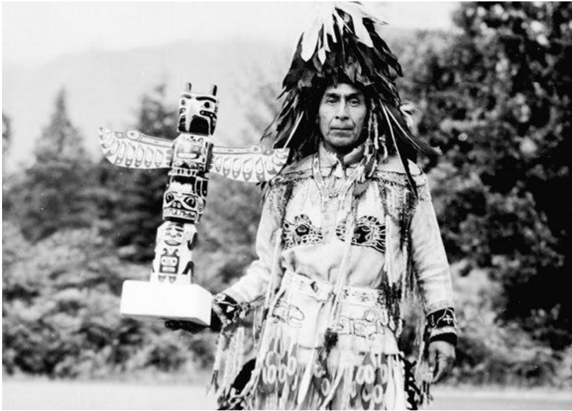
Coast Salish elder in traditional garments

Prior to European settlement and colonization of the Pacific Northwest, Coast Salish Indigenous tribes and nations freely thrived on the natural abundance of fish, plants, and other resources.