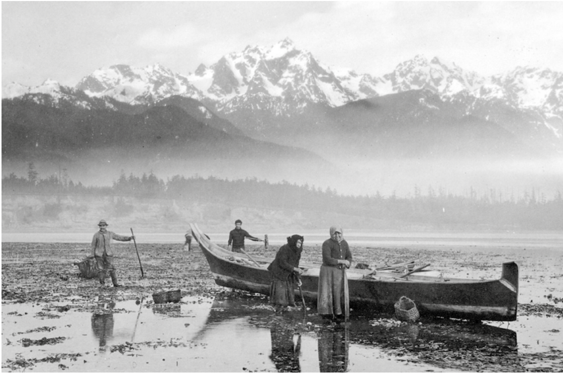
Clamming at low tide in Sequim Bay late 1800s.