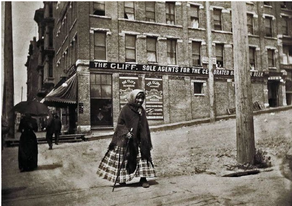
Princess Angeline, the eldest daughter of Chief Seattle, walking in downtown Seattle Sandra Osawa

The disputes over land between the Coast Salish tribes and the United States government have been numerous. Many treaties were signed by the Indigenous Peoples as a result of immense pressure by the government to do so, thus allowing tribal lands to be taken and developed by the United States. Some of the most prominent treaties include: