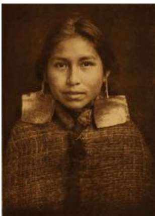
Portrait of a young Cowichan woman