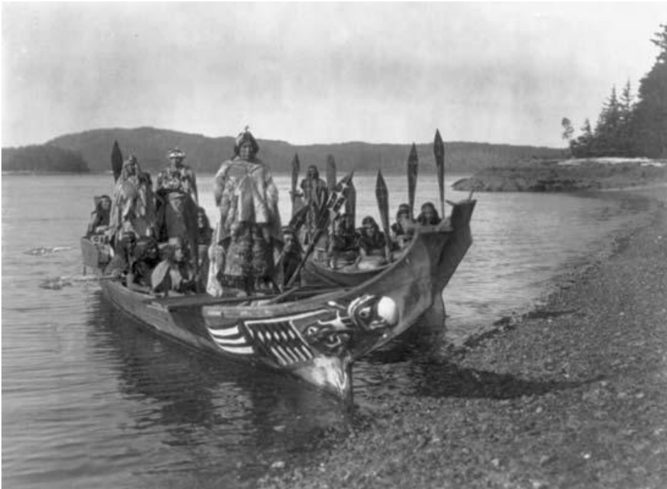
Coast Salish people in a canoe

What I have found unexpected about text mining investigations is the exclusion of Indigenous voices in this field. This class has taught me how humanities and technology can intersect.