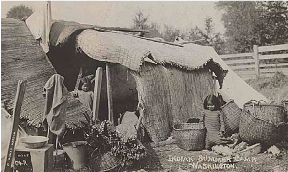
Summer Cattail Mat Shelters. cir. 1910.

To my surprise, the state of the texts I found was very tidy. The OCR levels were mostly above 80%, and many of them were about 90%. I believe that this is because most of the documents I found are official records of court cases, which are typed in English. I have very few handwritten materials, which could account for why the OCR levels of my documents are so high. However, the OCR levels of some of the treaties are a bit lower. I think this is because the treaties tend to be older, some from the 1800s. In addition, the indigenous names are not always recognized as proper English by the OCR, which could bring its level down a bit.