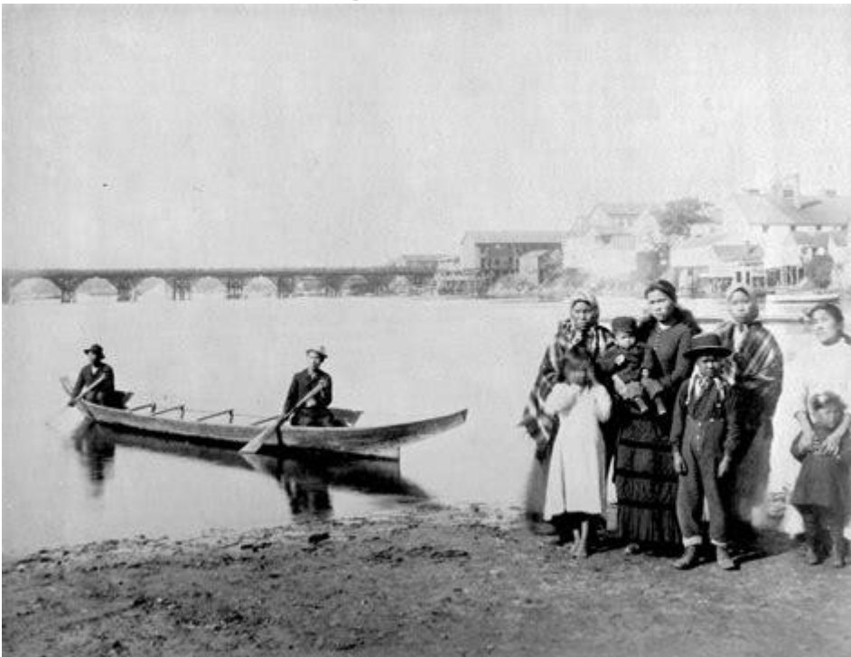
Coast Salish family in European dress https://www.salishseasidehaven.com/location/history