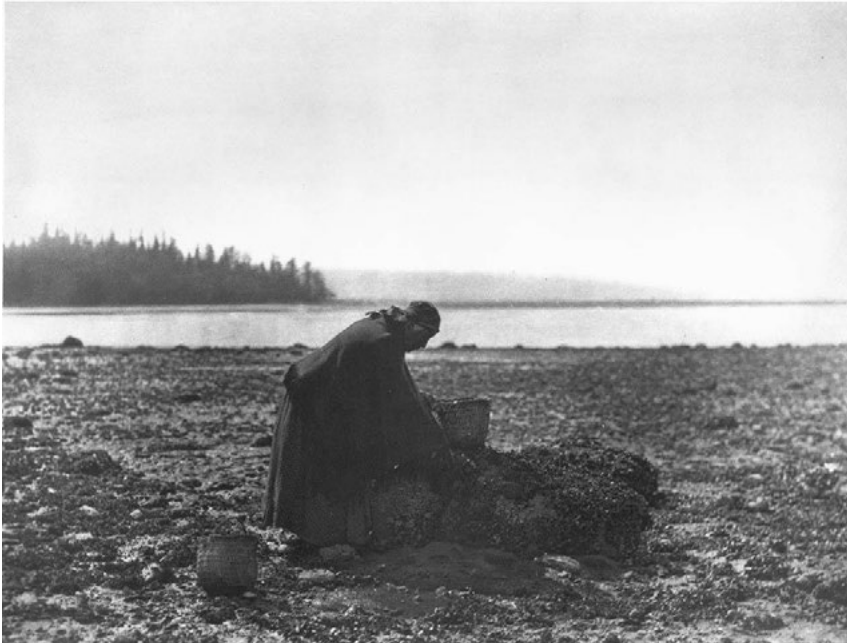
Suquamish woman gathering shellfish.

The six analyses I carried out in Gale Digital Scholar Lab were: