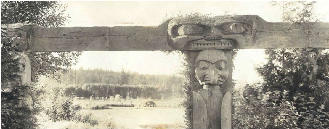
Coast Salish Art

Washington et al., Petitioners, v. United States et al., 423 U.S. 1086 (1976). Brief in Opposition (on Petition). 17 Nov. 1975. U.S. Supreme Court Records and Briefs, 1832-1978, https://link.gale.com/apps/doc/DW0102399715/DSLAB?u=dslaball&sid=DSLAB&xid=a8201181 . Accessed 23 July 2020