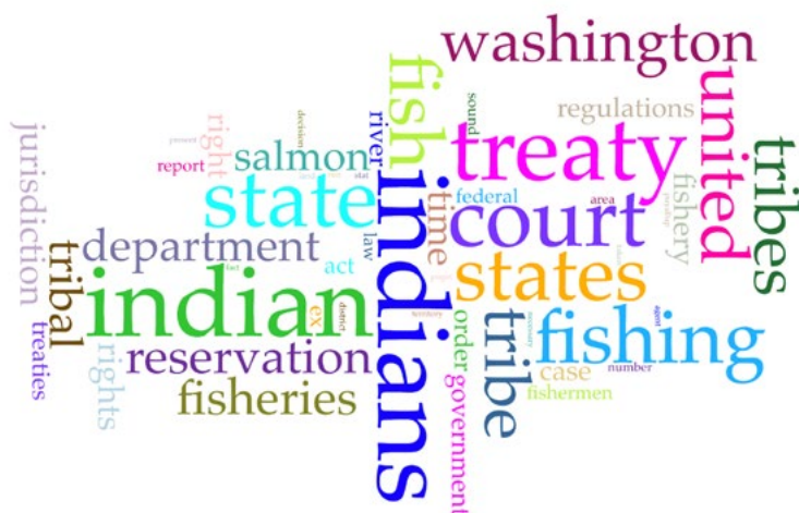
Voyant Cirrus Tool Visualization

Using the Cirrus tool with my customized text-cleaning configuration and stop-word list, I learned that aside from the terms that I expected to be the most prominent including "indian", "treaty", "court", and "fishing", phrases such as "reservation", "jurisdiction", "department", and "tribes" were also included. From this word cloud, I am beginning to understand that the majority of my content sets are actually legal documents. This is because much of the language used is very formal with legal terms included. It is also important to note that the documents are also fairly old, as the term "indian" comes up very frequently. Referring to indigenous peoples as "indians" is still prevalent today, but it is not politically correct, therefore for the term to be used in legal documents, I would assume that the documents were written in the past, prior to the cessation of the term "indian." This visualization is useful in answering my research question as it displays tribal names and other words that point to reasons behind disputes. I did not curate any additional data for this analysis.