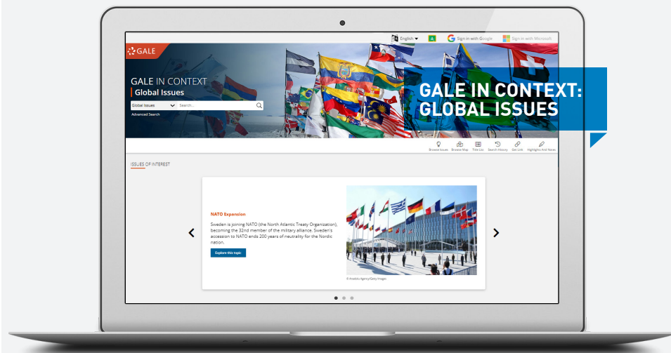
Product screen capture as of May 2024. Actual interface may vary.