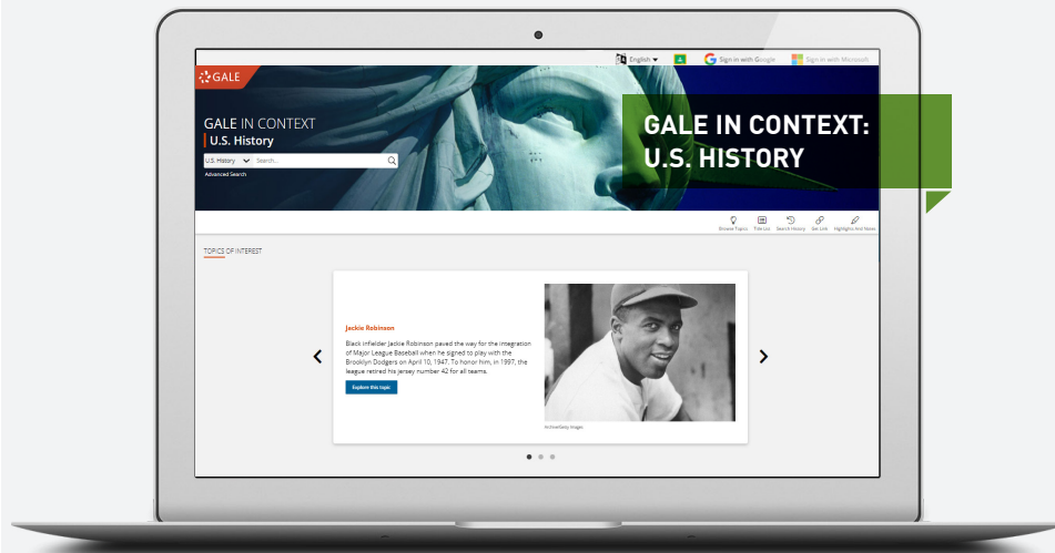
Product screen capture as of May 2024. Actual interface may vary.